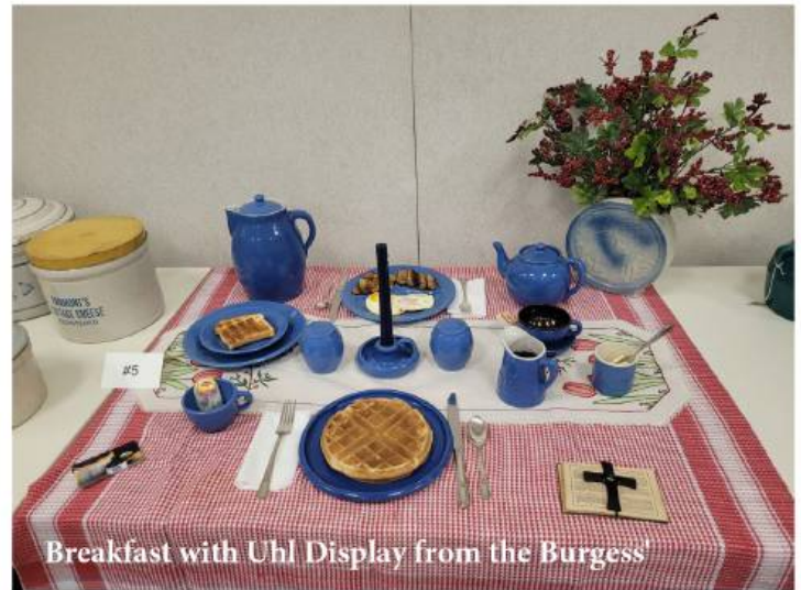
Breakfast with Uhl Display from the Burgess'