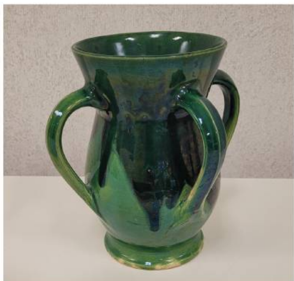
Jane Uhl 4 handled mug