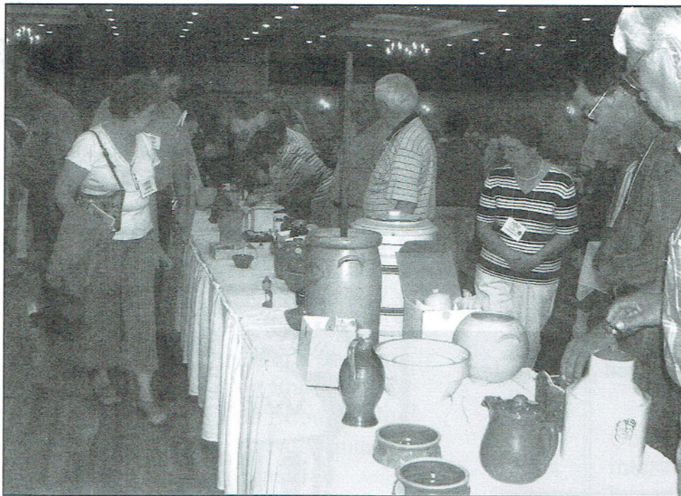
Saturday Morning Sale