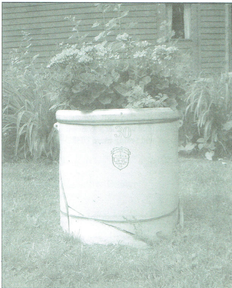
One last use for a big UHL crock

We have several new members that are excited about the convention. PLEASE help us by bringing a few pieces to display in a secure cabinet for all to enjoy. We will also be displaying our look alikes and welcome any that you may have in your collection.