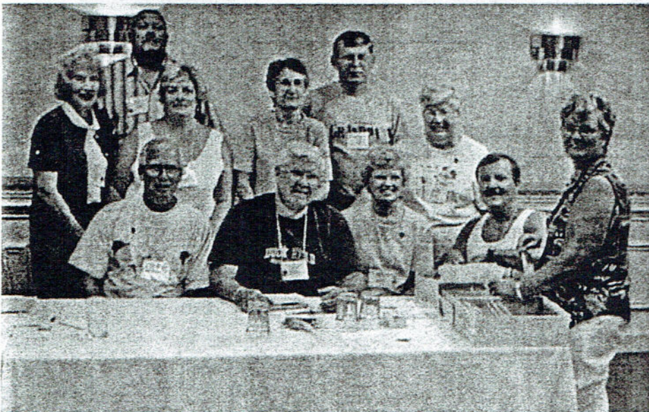
Board Members. Hard at work!