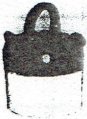
HARVEST JUG STRAP HANDLE