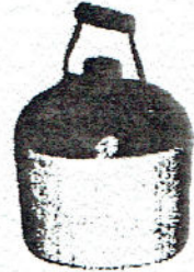
SQUAT BAILED JUG