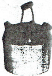
HARVEST JUG WIRE HANDLE