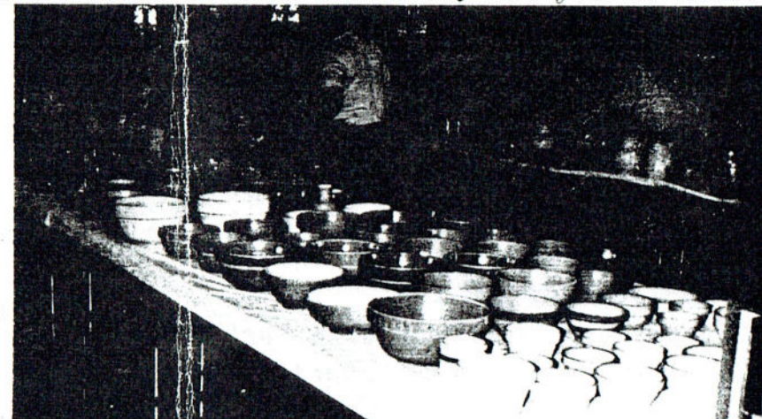
*These photos are available from Henagers 3/$1.00