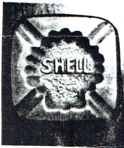
2 1/4" x 2 1/4"