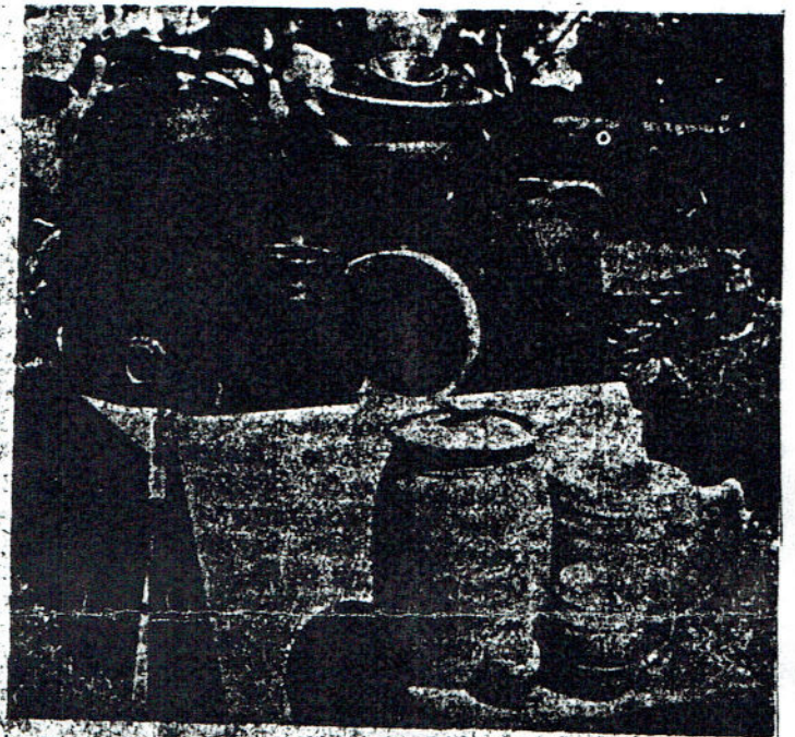
Ernestine Fisher's Uhl pottery collection includes top, left to right, water or wine jug, canning jar, cream and butter jar and bowl and water jug. On the footstool is a cookie jar with lid, a miniature jug and a pitcher and mug.

Mrs. Fisher recalls in the days before paper cups, the mugs were always in use for either milk, hot chocolate or beer.